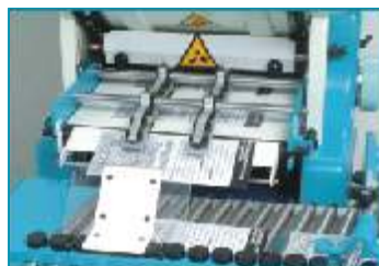
Transfer Unit for Roller Conveyor