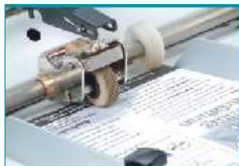
Automatic friction feeder.