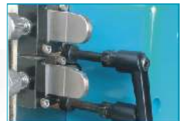
Roller Gap adjustment by calipers

The "SUPERFOLD" PGV is equipped with a high-speed friction feeder enabling it to handle a wide range of paper with ease and efficiency. The belt drive coupled with thick end plates ensures the machine's smooth and low noise working. The cumbersome task of setting a new job is made easy with the availability of caliper setting and jogging mode.