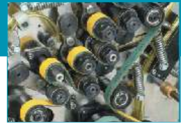
Silent belt drive