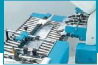
FDC + Steel Roller Conveyor